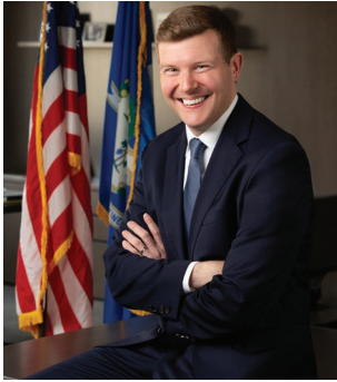
Sean Scanlon State Comptroller @CTComptroller